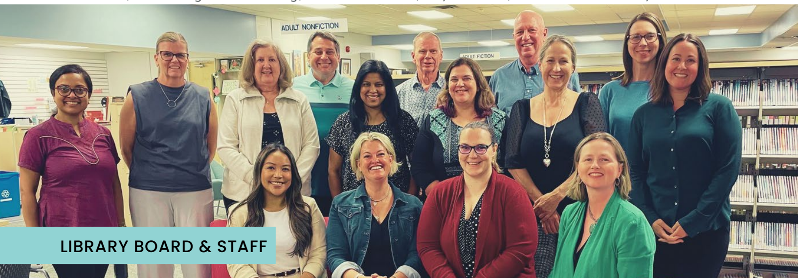
LIBRARY BOARD & STAFF